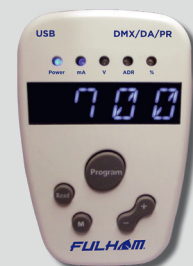
TPSB-100EU SmartSet Controller

FULHAM www.fulham.com Europe • North America • China • India